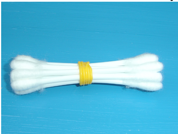
A Crop Bale is represented by a bundle of ten cotton swabs bound together with a rubber band.