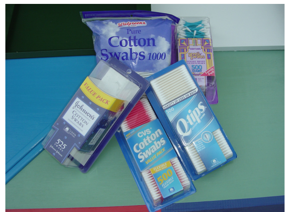
Cotton swabs can be purchased from a variety of stores