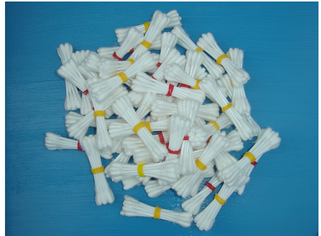
There are 52 bundles of cotton swabs used for the mission.