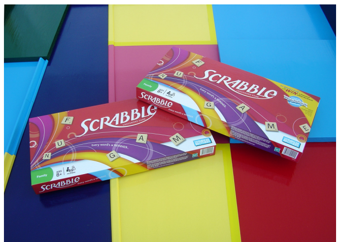
Scrabble® games can be purchased from department, toy, grocery, and online stores.