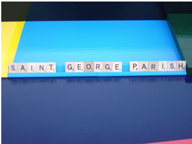
A Book is represented by a Scrabble® tile.