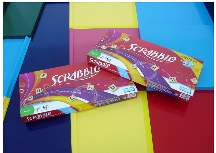
Scrabble® games can be purchased from department, toy, grocery, and online stores.