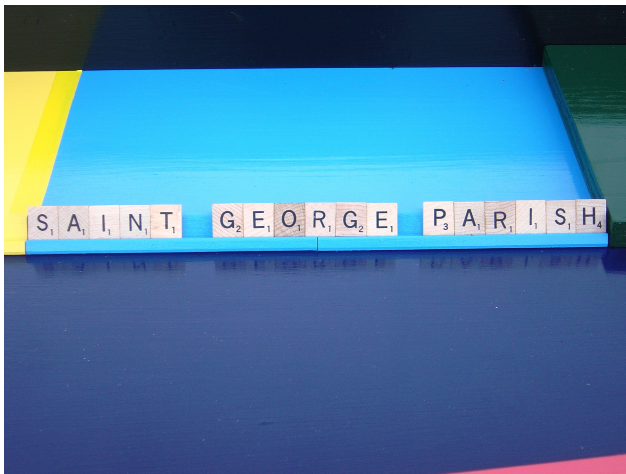
A Book is represented by a Scrabble® tile.