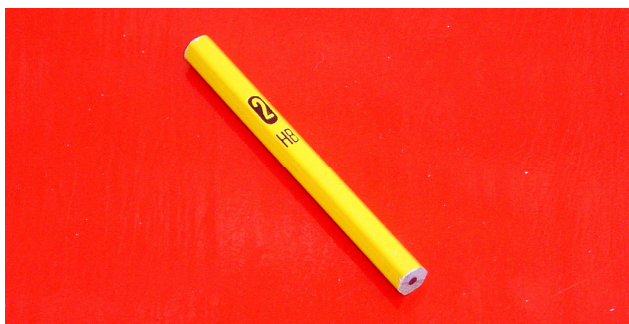
A Log is represented by a three inch long hexagonal pencil