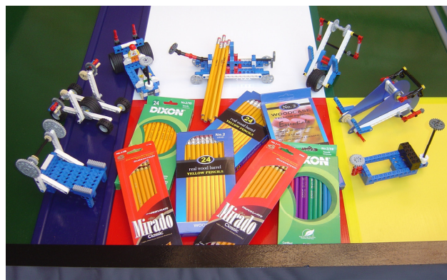
Pencils can be purchased from department, grocery, and drug stores