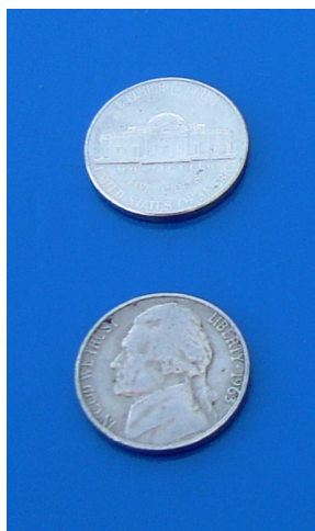
A Nickel represents The Declaration Of Independence.