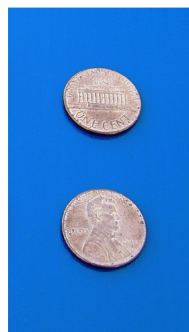
A Penny represents The Bill of Rights.