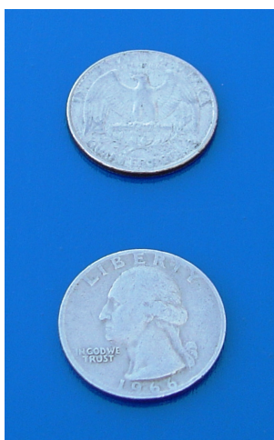
A Quarter represents The Constitution.