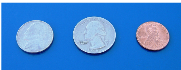
The Founding Documents are represented by coins.