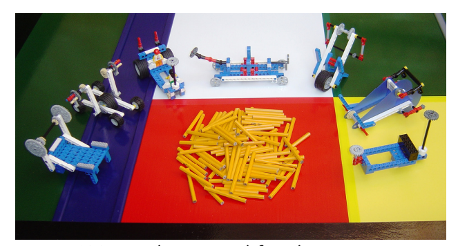
100 pencils are used for the mission