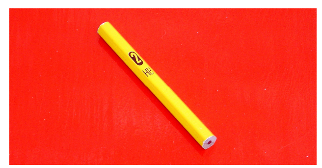
A Product is represented by a three inch long hexagonal pencil