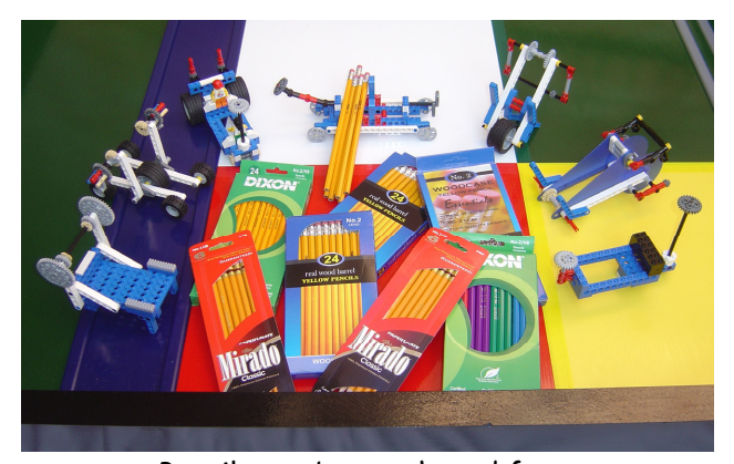
Pencils can be purchased from department, grocery, and drug stores