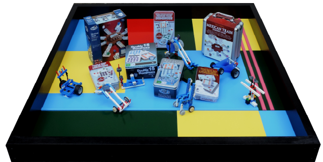
Dominoes can be purchased from a variety of department, toy, dollar, and drug stores