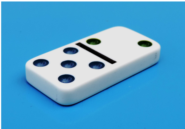
A DigBot is represented by a domino