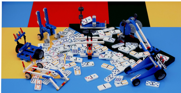
84 dominoes are used for the mission