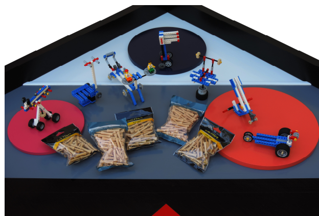
Step golf tees can be purchased from a variety of golf, sporting goods, and internet stores