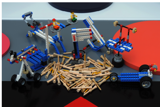
64 wood step golf tees are used for the mission