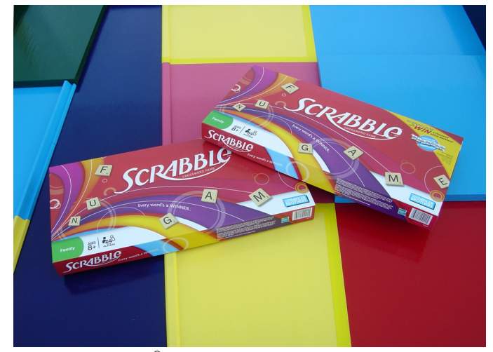
Scrabble<sup>®</sup> games can be purchased from department, toy, grocery, and online stores.