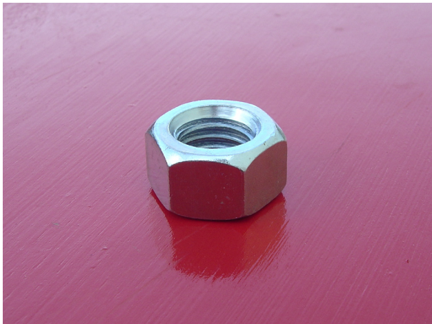
A Reef Robot is represented by a \frac{1}{2} " nut.