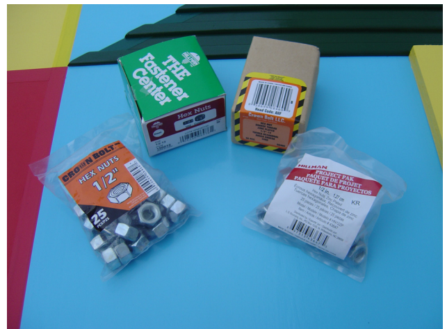
The nuts can be purchased from hardware stores and come in a variety of packaged quantities.