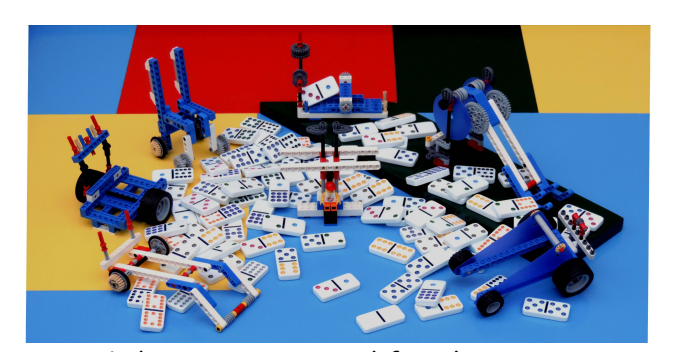
84 dominoes are used for the mission