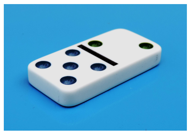
A DigBot is represented by a domino