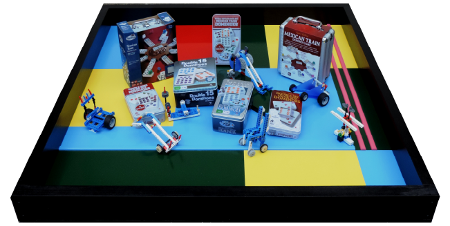
Dominoes can be purchased from a variety of department, toy, dollar, and drug stores