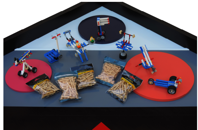
Step golf tees can be purchased from a variety of golf, sporting goods, and internet stores