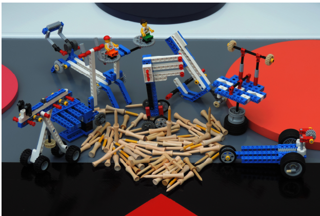
64 wood step golf tees are used for the mission