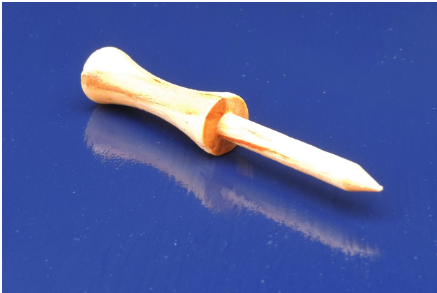
A TEE is represented by a 2\frac{3}{4} " wood step golf tee